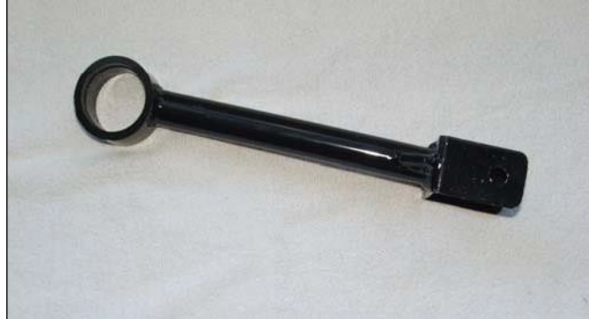
Metric Upper Arm