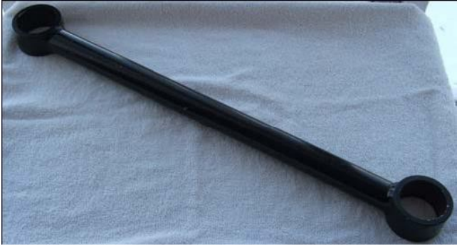
Metric Lower Arm