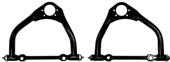
(example shown: UB Machine)