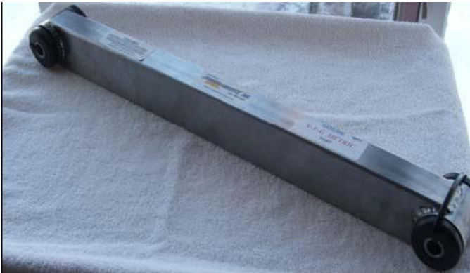
Metric Lower Arm

Contact: 506-832-0884 Address: 139 Bayside Dr. Saint John, NB E2J-1A3