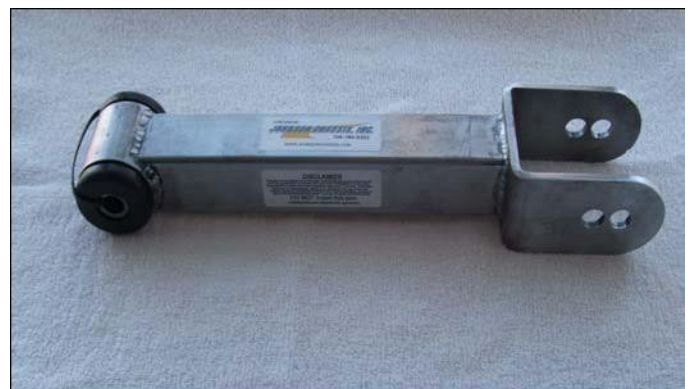
Metric Upper Arm