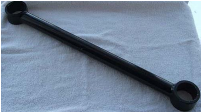
Metric Lower Arm Metric Upper Arm