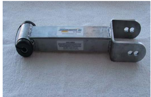
Metric Upper Arm

NOTE: The forward holes in the Johnson Chassis upper arm must be filled or otherwise made non-functional. This will be strictly enforced. The arms must meet OEM length.