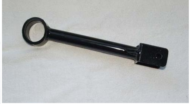
Metric Lower Arm Metric Upper Arm