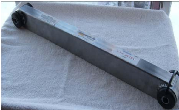
Metric Lower Arm