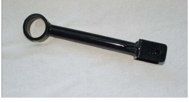
Metric Lower Arm