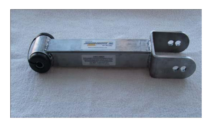
Metric Lower Arm